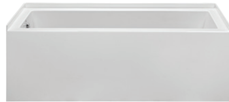
Front view of the integral skirt.