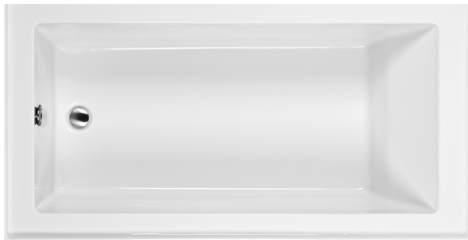
Features integral front skirting and integral tile flange on 3 sides.

NOTE: Filling this tub to the maximum may require an above average size or dedicated water heater.